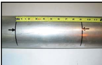
5" Exhaust Only

Select a location that has a minimum of 12" of straight pipe and has sufficient clearance for installation and servicing of the exhaust brake. This location should be as close to the turbocharger as possible and away from dirt and road spray. A 7" section of exhaust pipe needs to be removed. Measured and mark the pipe for cutting.