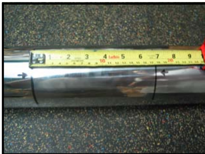
4" Exhaust Only