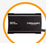
SXV100/ SXV200 Tuner