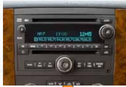
Factory Radio (Varies by vehicle)