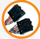
Connect Vehicle Harness (Varies by vehicle)