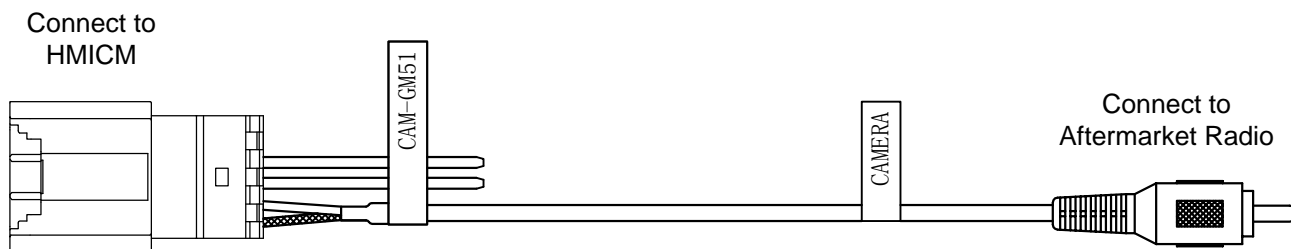
Illustration / Schematic