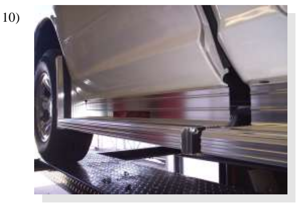
Tighten any and all loose bolts. Repeat all steps for opposite side.