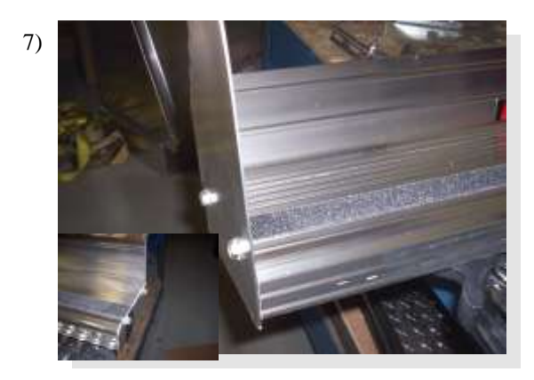
Attach stone guard and end cap to running board using 3/8" self threading bolts.