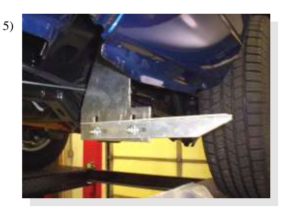
Attach a 3124F angle bracket to the FL152 with 5/16" bolts and nuts. Snug but do not tighten at this time.