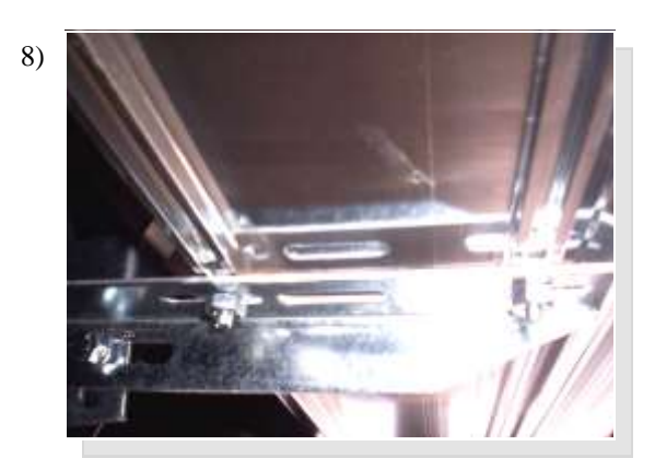
Place the board on the brackets with the bolts through the slots. Fasten with 1/4" nuts.