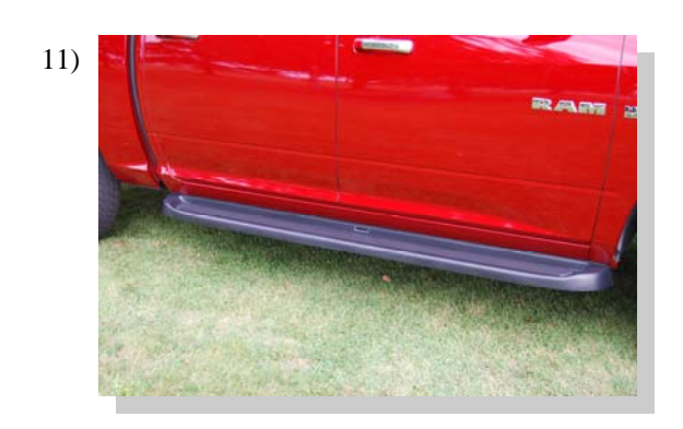
Level board and tighten all brackets. Repeat all steps for opposite side.