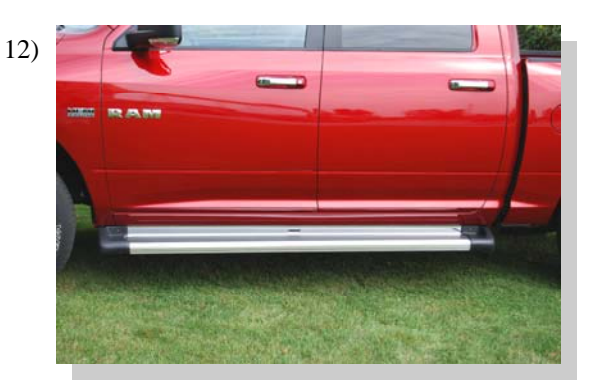
Level board and tighten all brackets. Repeat all steps for opposite side.