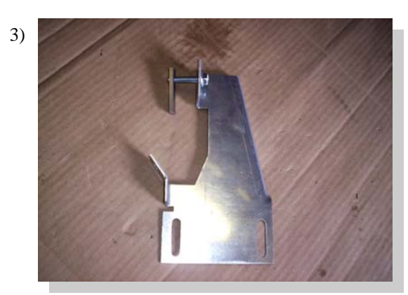
Assemble brackets as shown using one long 5/16" bolt and steel retaining nut. (FL143 shown)