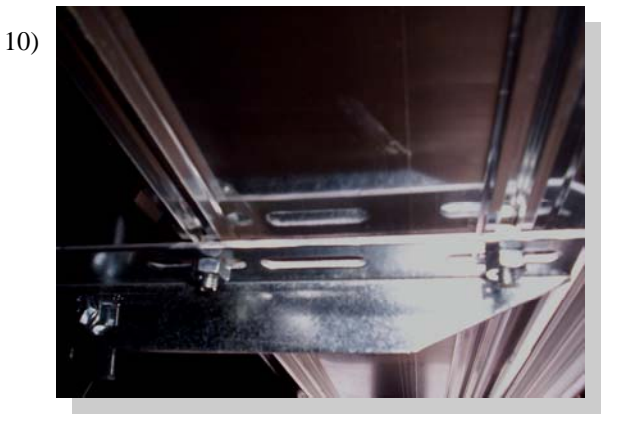
Place the board on brackets with bolts through slots. Attach with 1/4" nuts.