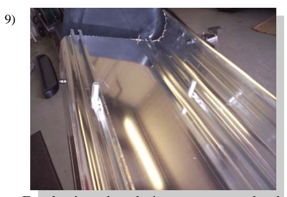
For aluminum boards, insert one square head bolt into track for each bracket.