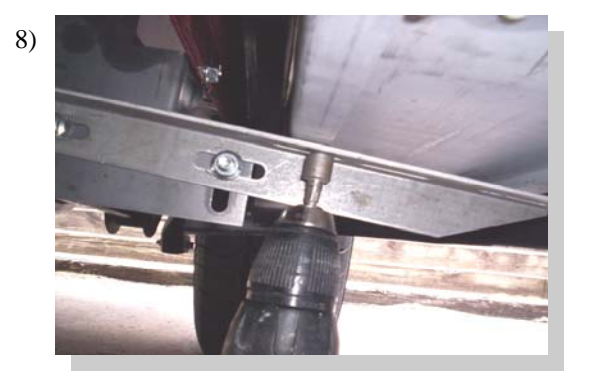
For plastic boards, place board on brackets to desired location. Attach by using 3/4" long self drilling screw into the steel support under the board.