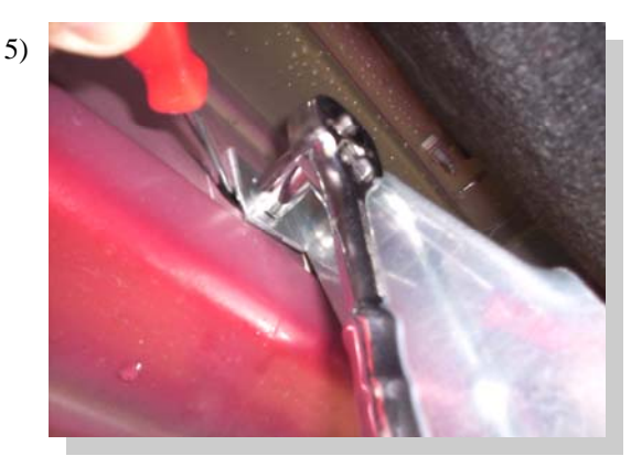
It may be necessary to use a small screw driver to hold against the retaining nut to keep it from turning while tightening the bolt.