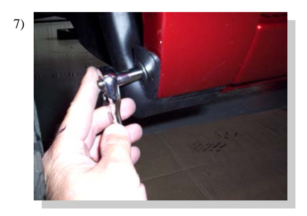
It may be necessary to remove the small stone guard in the front fender well. Test fit your board to see if it will need to be removed. If it does, remove the small screw holding it in place and then unsnap. Reinstall the screw.