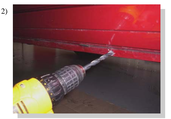
At each of the locations from step one, drill a 23/64" hole through the pinch weld.