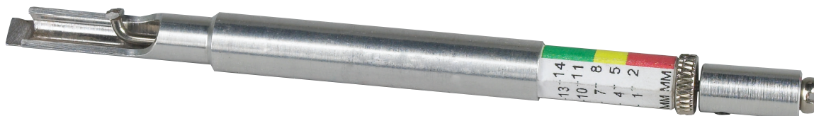
6596 Brake Pad Gauge

Attain measurement without removing any parts from the vehicle.