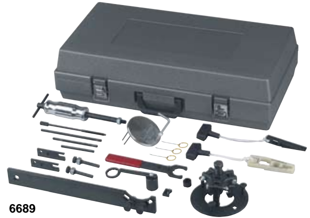
Chrysler / Jeep Cam Tool application chart for 6689 Note: Some applications require more than one tool to accomplish the task.

No. 6689 – Chrysler/Jeep cam tool set. Wt., 25 lbs.