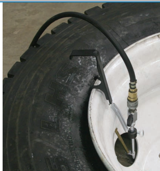
The new Hands Free Air Chuck makes bead-seating a one-man job!

Adjustable collar for various wheel widths.