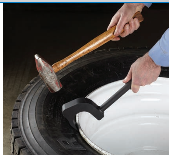
Excellent for damaged tires or tires with weak sidewalls where conventional bead breakers will not work.

Handle keeps your other hand away from the striking surface.