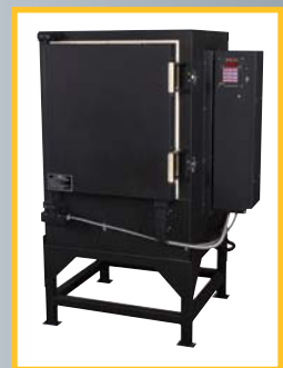
5281 Thermal Processing Unit