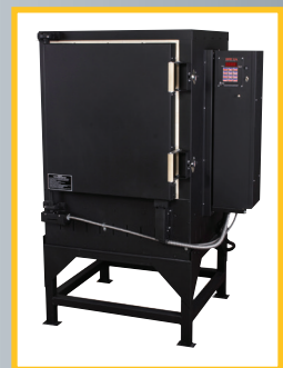
5281 Thermal Processing Unit