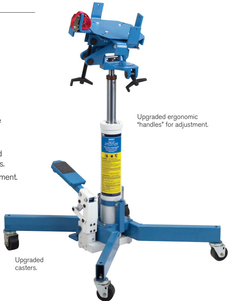
Upgraded ergonomic "handles" for adjustment.