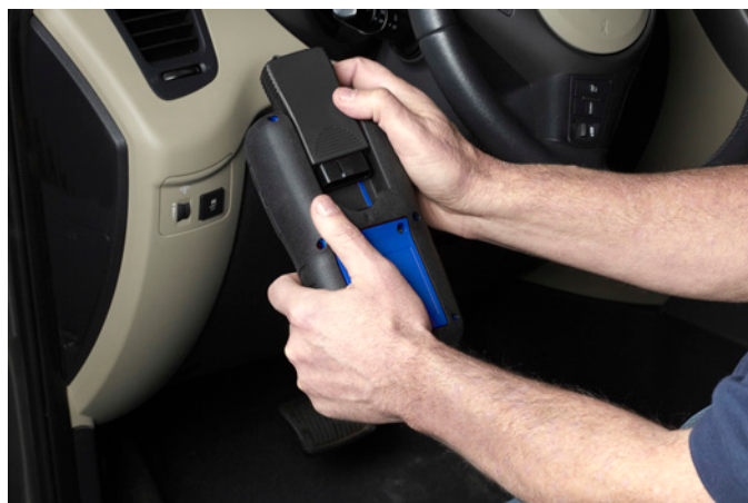
Dock the OBD-II Adapter on the back of the Handset