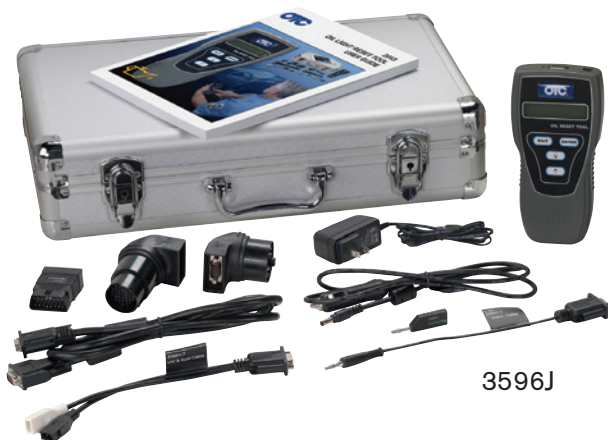
3596J-UPD – OTC Oil Light Reset Update Kit.