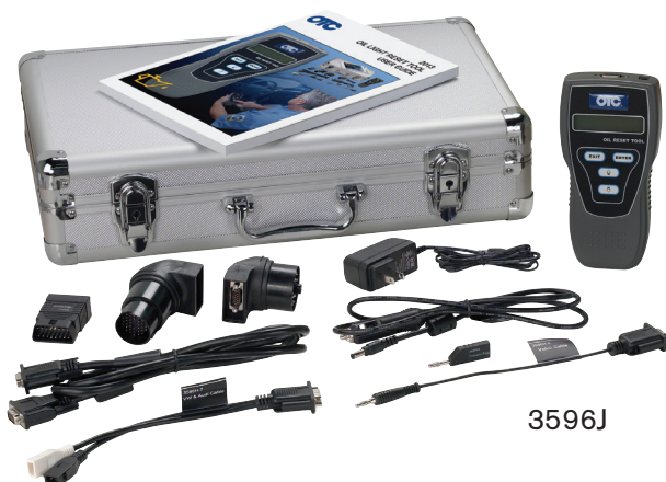
3596J-UPD – OTC Oil Light Reset Update Kit.