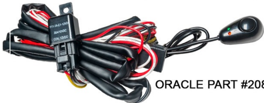
ORACLE PART #2088-504

The light bar is designed to work with the factory AUX switches if your vehicle is not equipped with the factory AUX switches you can add the optional wiring harness which includes a switch (SOLD SEPARATELY).