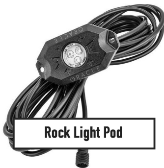
Rock Light Pod

*Never Cut or Modify the Rock Light Pod Cables. To extend use the Rock Light Extension Cables (ORACLE Part # 5814-504)*