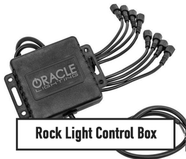
Rock Light Control Box