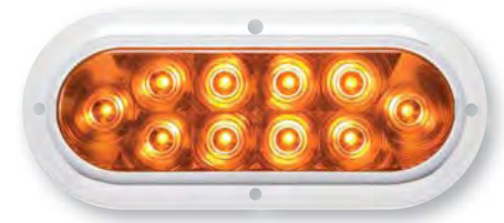
STL78AB with A78CB1