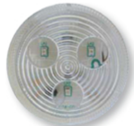
MCL57RCB / MCL57ACB