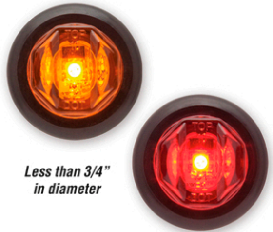
Less than 3/4" in diameter

Less than 3/4-inch in diameter, Uni-Lite™ MCL12 series lights fit the tightest applications. Single diode P2 rated lights packaged with flexible grommets may be used as side marker or clearance lights. Feature sonically sealed, waterproof lens and housing in a single unit. Design includes both lead and ground wires.