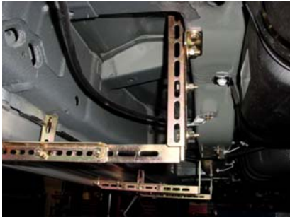
Driver side shown above & next 2 photos.