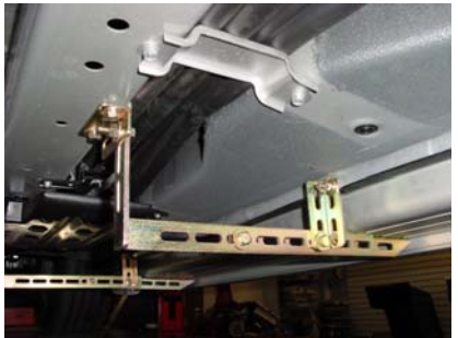
Passenger side shown above & next 4 photos.