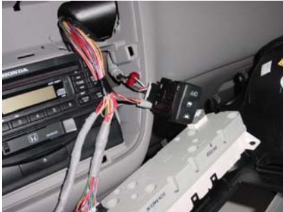
Wire location is behind radio bezel

98-09 Odyssey (low clearance) *Use bracket#4 for extension, may require trimming brackets.