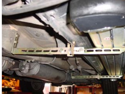
Driver side shown above.