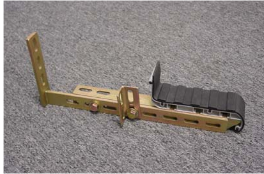
Configuration to mount on outside pinch weld.