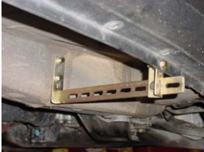
Passenger side shown above, front and rear.