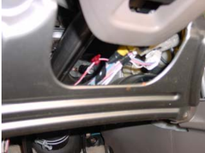
Dome light trigger wire is red/white (-) under the steering wheel column.

96-03 RX-300 *May require trimming of end cap flanges for proper fitment.