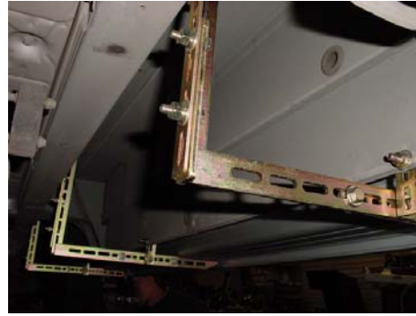
Passenger side above w/ bracket#1,2,4,5.