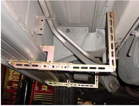
Driver side above w/ bracket#1,2,3,4.

98-03 Full Size Van (long wheel base w/ hinged door) *May require bracket#4 for extension.