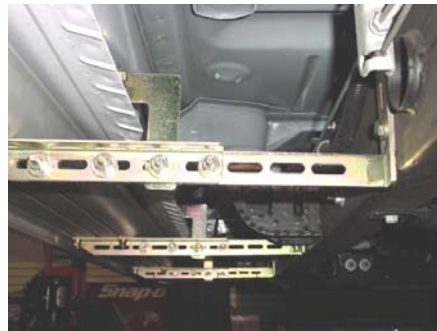
Driver side shown above.