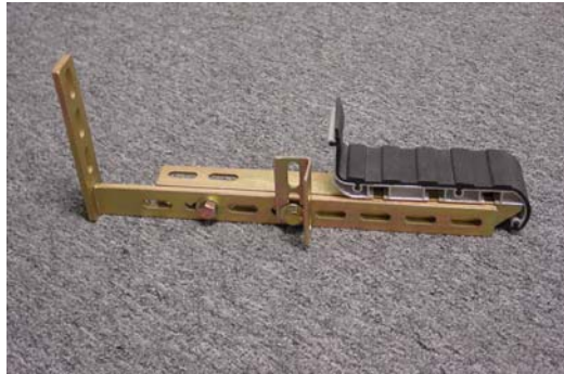
Configuration to mount on outside pinch weld.