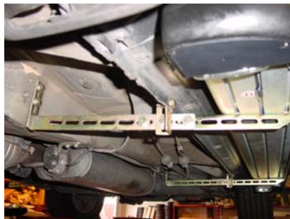
Driver side shown above.