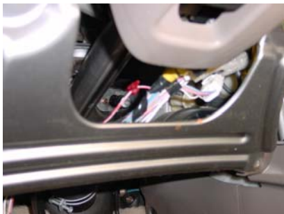
Dome light trigger wire is red/white (-) under the steering wheel column.

96-03 RX-300 *May require trimming of end cap flanges for proper fitment.