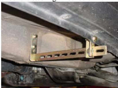
Passenger side shown above, front and rear.