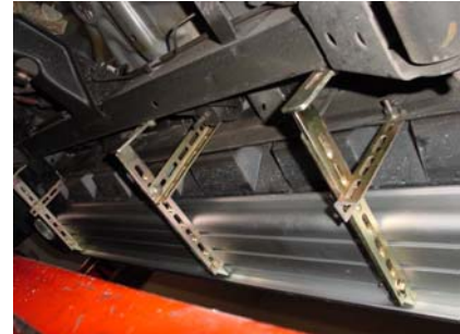
Driver side assembly shown above.