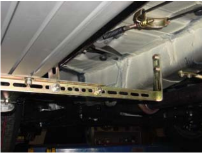
Driver side front using #1,2,5 mounting brackets.

01-06 Highlander (w/o mud guards) *See pictures below. 2 brackets per side are used on this vehicle.