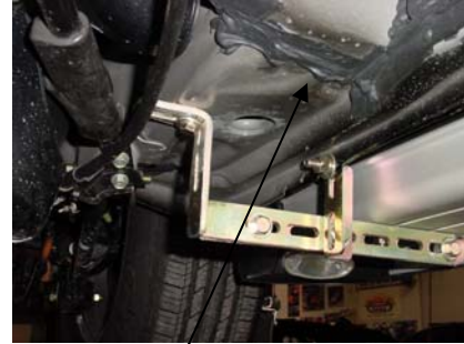
Optional: Driver side rear using #1,2,5. bent bracket and mounted to the floor.