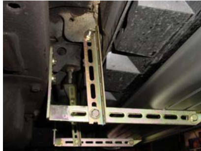
Picture of mid & rear bracket config.