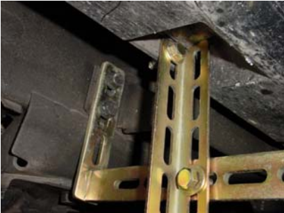
Picture of front bracket config.

01-05 Axiom (w/o mud guard) *Bracket# 1,2,4 are to be used for this vehicle.