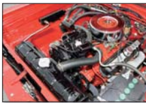
Applications for Six Cylinder, Small Block or Big Block

OER® Authorized radiators for a wide variety of Classic Dodge and Plymouth A, B & E-Body models. Each radiator is manufactured in the correct copper/brass materials for an original appearance and fit. Will install without modifying your radiator support or support top panel. Features 1/2" tubes on 9/16" centers. Available in 3 or 4 rows. No exchange necessary, and no core charge required. Made in USA.