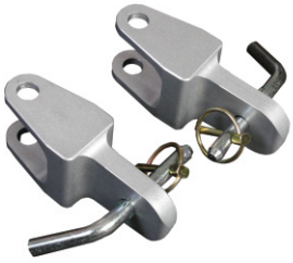
Demco Or use the Universal Blue Ox to fit a Demco baseplate starting with #9518