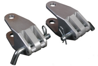
Universal Roadmaster 1/2"hole

Here at NSA RV Products Inc. we are all about keeping it simple, so we have developed a universal clevis to fit a Blue Ox or Roadmaster baseplate. To make a Blue Ox clevis fit a Roadmaster 1/2" hole you just need the Conversion Kit. If you need to make it fit a Roadmaster 3/4" hole drill the 1/2" hole out to 3/4" and order the Conversion kit.