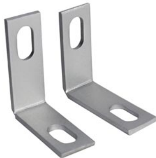
Large Top L-Brackets (2006 - 2007)