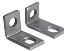
Small Top L-Brackets (2007.5 - 2010)