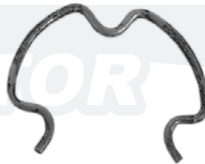
QD Spring Clip Removed (Figure 2)