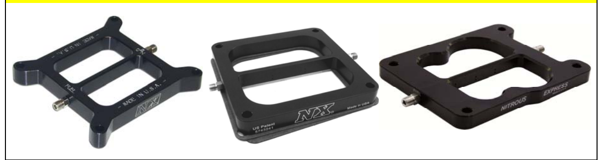
Stage Six, 50-300HP Plates (4150 & 4500)