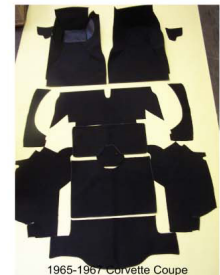
1965-1967 Corvette Coupe

Great Carpets to make that Daily or Weekend Driver Car look Clean and Attractive