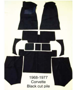
1968-1977 Corvette Black cut pile

Best Quality Aftermarket Replacements (Not OE Duplicates)