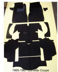
1965-1967 Corvette Coupe

Great Carpets to make that Daily or Weekend Driver Car look Clean and Attractive