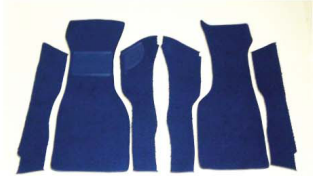
1963-1964 Corvette 540 Navy 80200 loop

Complete Interior Kits including Rear Wheel Wells and Rear Deck