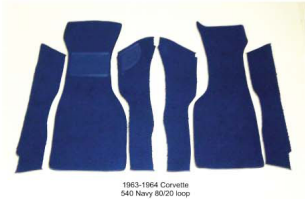
1963-1964 Corvette 540 Navy 80/20 loop

Complete Interior Kits including Rear Wheel Wells and Rear Deck