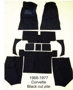
1968-1977 Corvette Black cut pile

Best Quality Aftermarket Replacements (Not OE Duplicates)