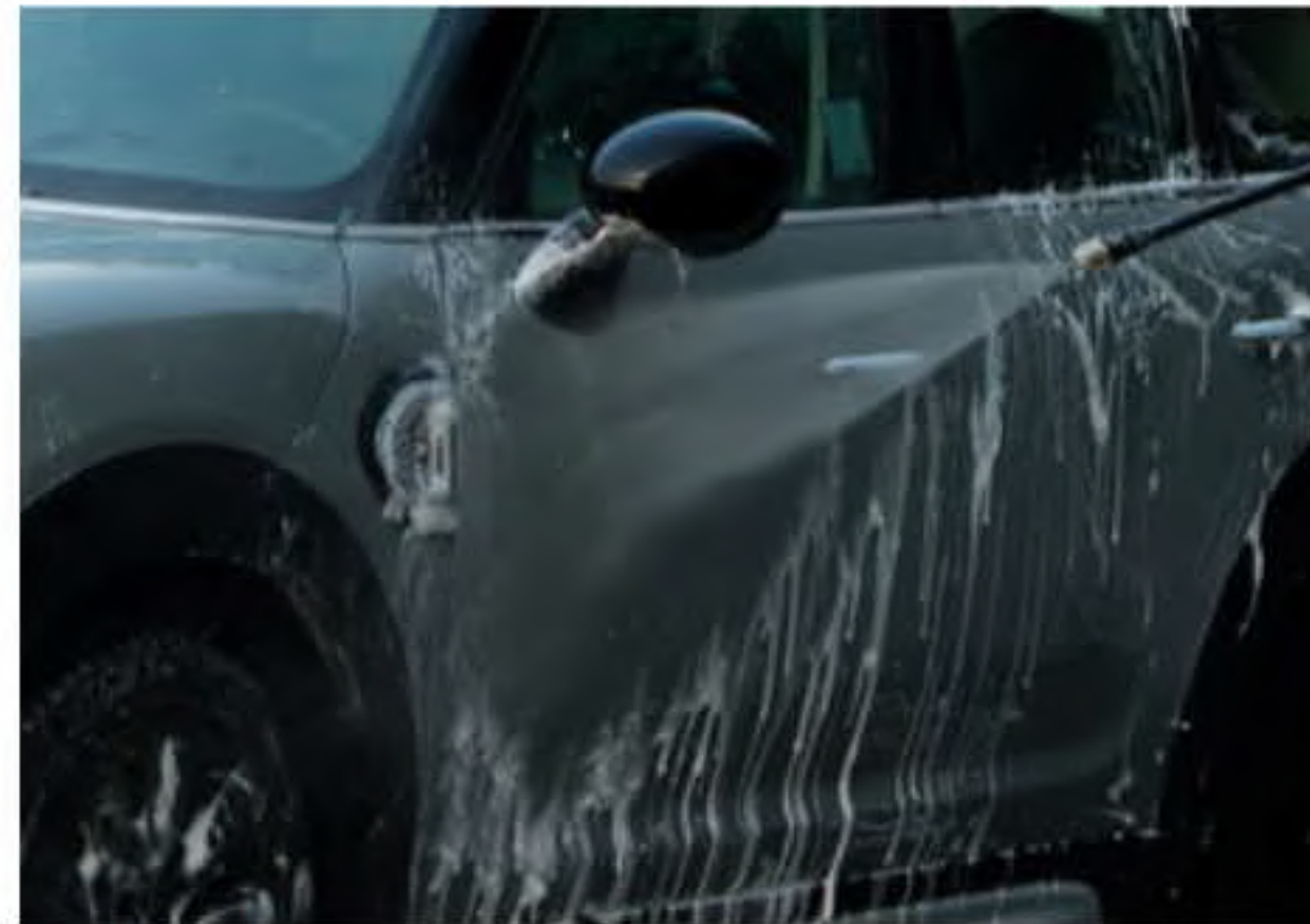
Step 5: Spray surface clean of soap working from the top down.