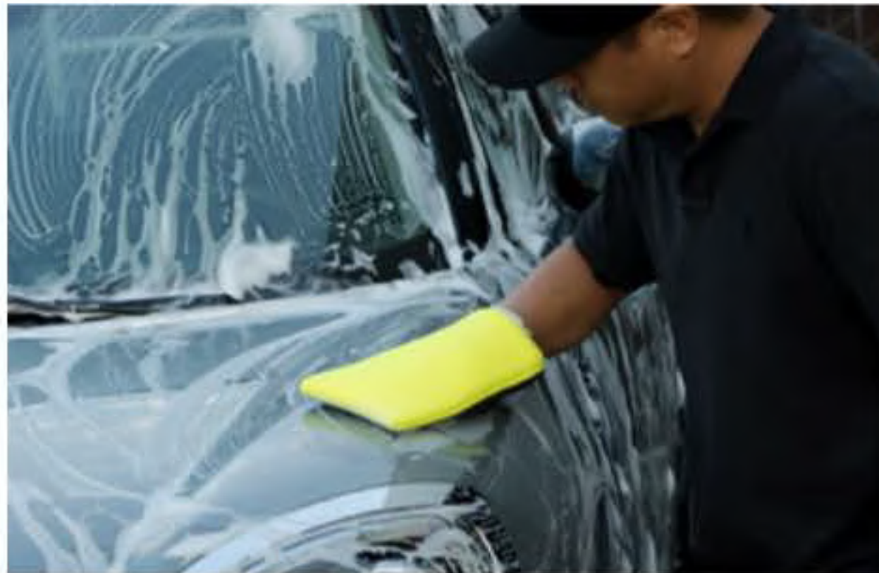
Step 4: With light pressure clean the surface with wash mitt.