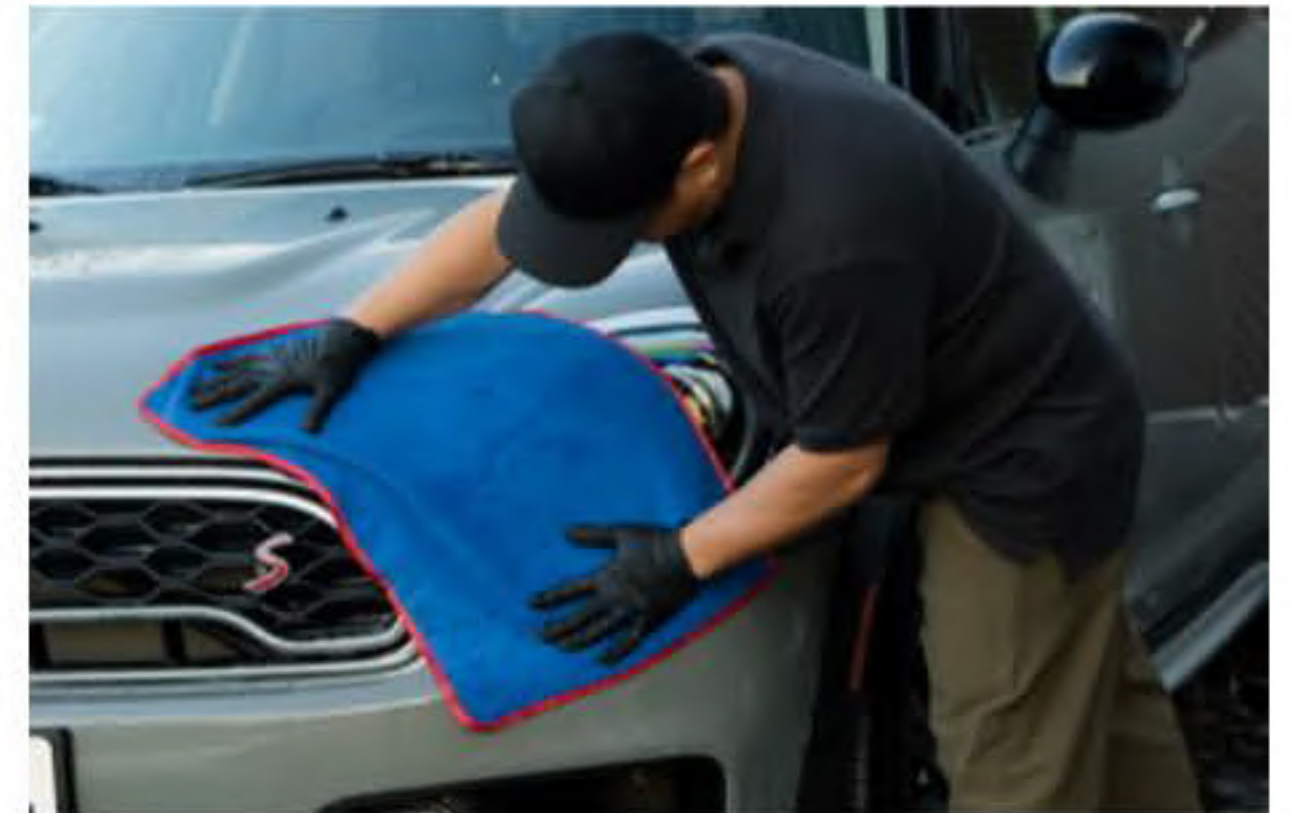
Step 6: Wipe surface dry using a chamois and a soft micro fiber towel.