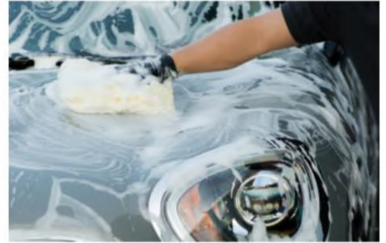
Step 3: Lather the surface with generous amount of soap.