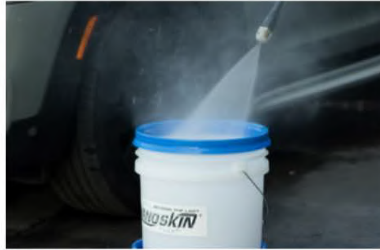
Step 2: Fill bucket with water creating desired amount of suds.