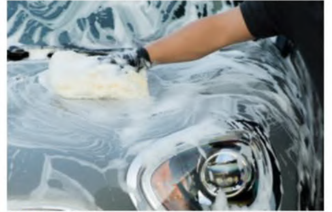
Step 3: Lather the surface with generous amount of soap.