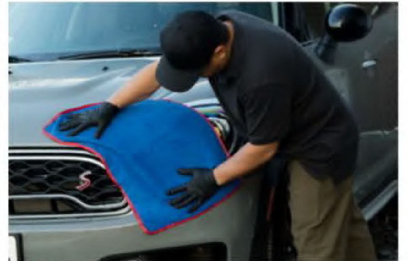
Step 6: Wipe surface dry using a chamois and a soft micro fiber towel.