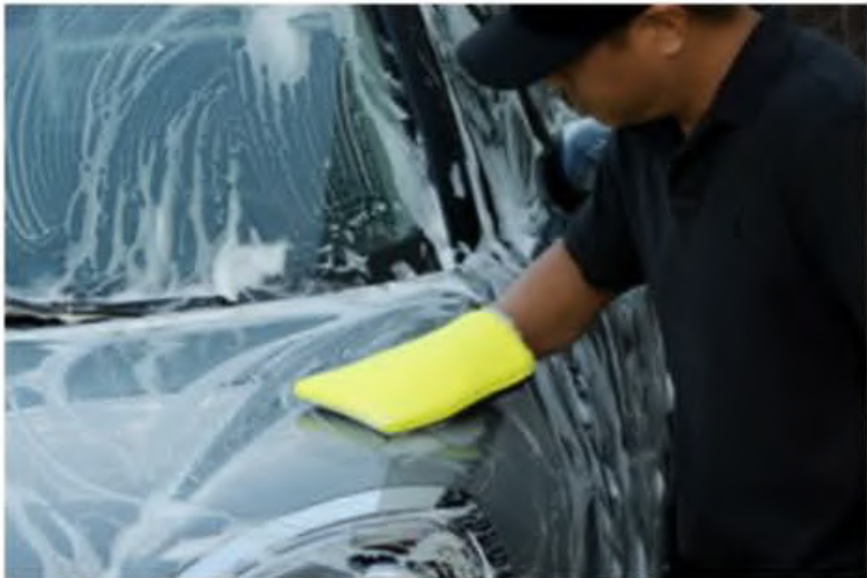
Step 4: With light pressure clean the surface with wash mitt.