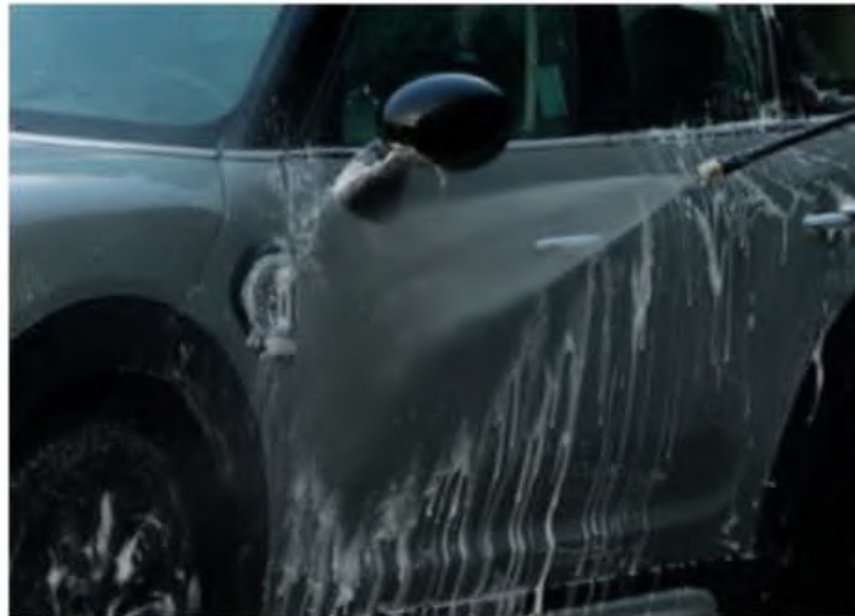
Step 5: Spray surface clean of soap working form the top down.