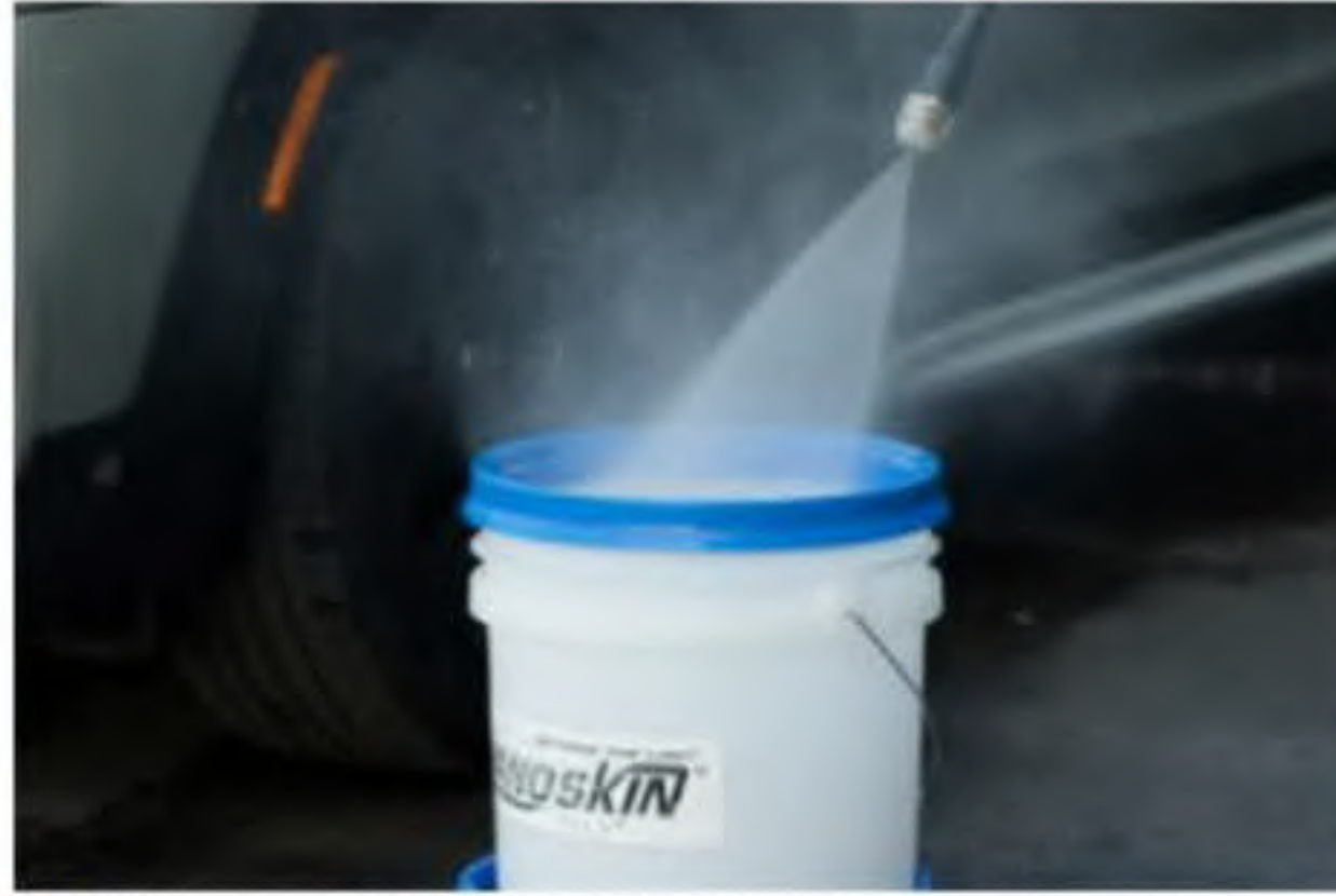
Step 2: Fill bucket with water creating desired amount of suds.