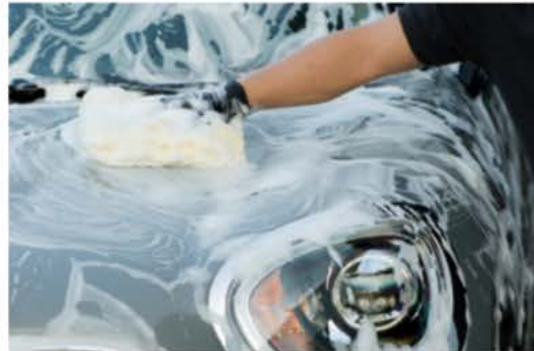
Step 1: Lather the surface with generous amount of soap and lather. Loosen any dust or dirt in preparation for Autoscrub Wash Mitt.