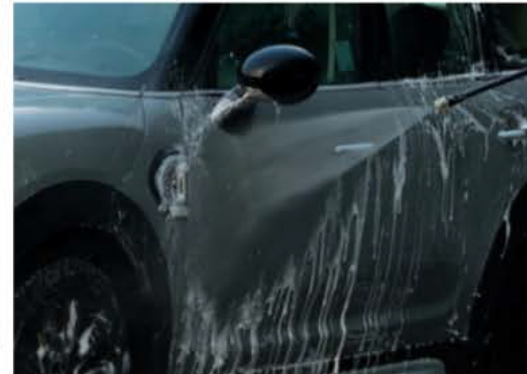
Step 3: Spray surface clean of soap working form the top down.