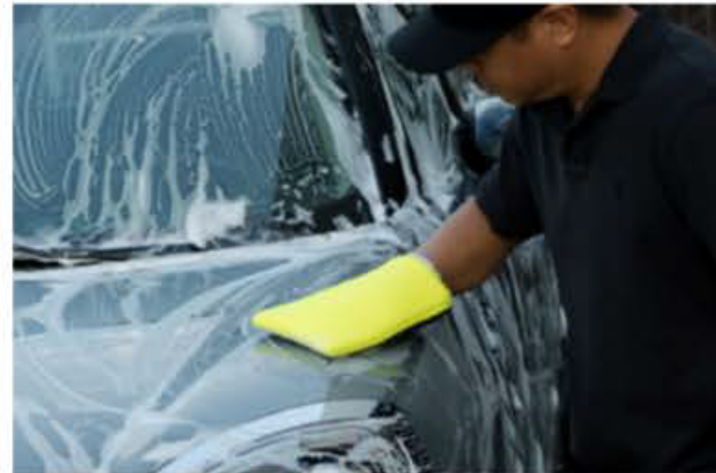
Step 2: Slide Autoscrub across the lubricated paint or glass surface using a back and forth motion with light to medium pressure.