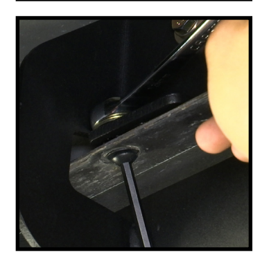
Avoid using power or air tools. Tighten upper mounts first then pinch weld bolts. Tighten to