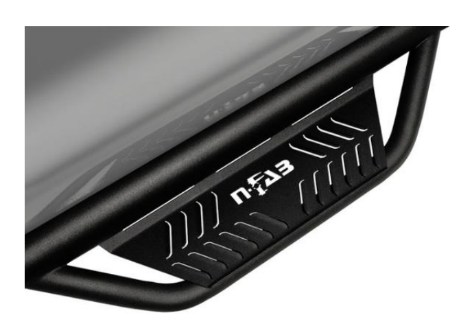
Step 1: Locate the driver side step rail.