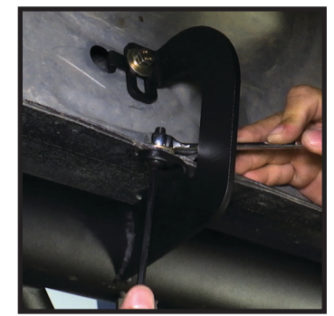
STEP 6: Avoid using power or air tools. Tighten pinch weld mounts first then upper bolts. Tighten to 20ft lbs torque to secure the board to the truck. Repeat the same procedure to the other side.