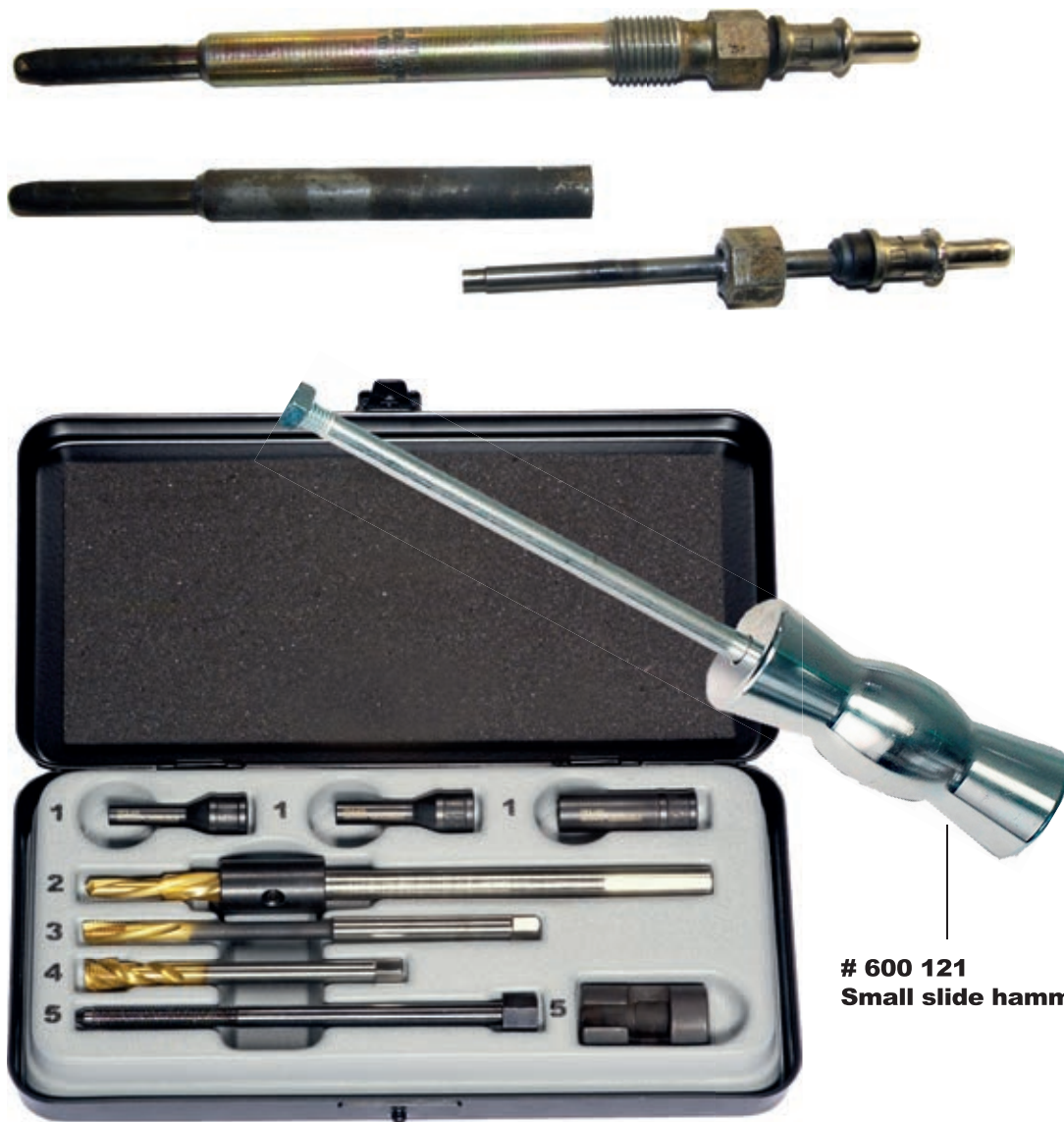
# 600 121 Small slide hammer