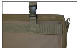
Touch Fasteners closed