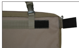
Touch Fasteners Opening