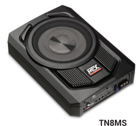
Perfect for underseat or behind seat installations