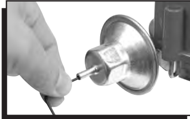
Figure 2 Adjusting the Vacuum Advance.

You can easily adjust the vacuum advance of the Street Fire Distributor. Insert a 3/32" Allen wrench in the canister inlet and turn the adjustment screw clockwise until it is all the way in (Figure 2). Counter clockwise reduces the advance, clockwise increases.