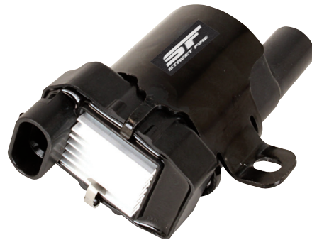
L-Series Truck '99-'07, PN 5509/PN 55098