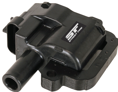
LS1/6, '98-'06, PN 5508/PN55088

There are several versions of LS coils, it is important to verify the correct coil for your application.