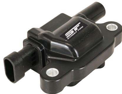
LS2/3/4/7/9, '05-'13, PN 5511/PN 55118