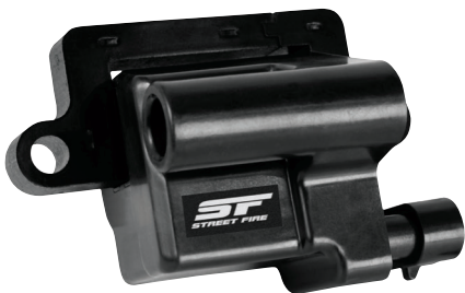
L-Series Truck, '99-'09, PN 5510/PN 55108