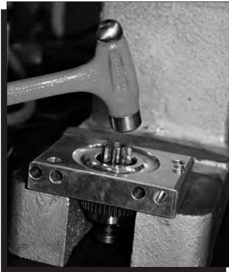
Figure 1 Removing the Pinion Assembly.