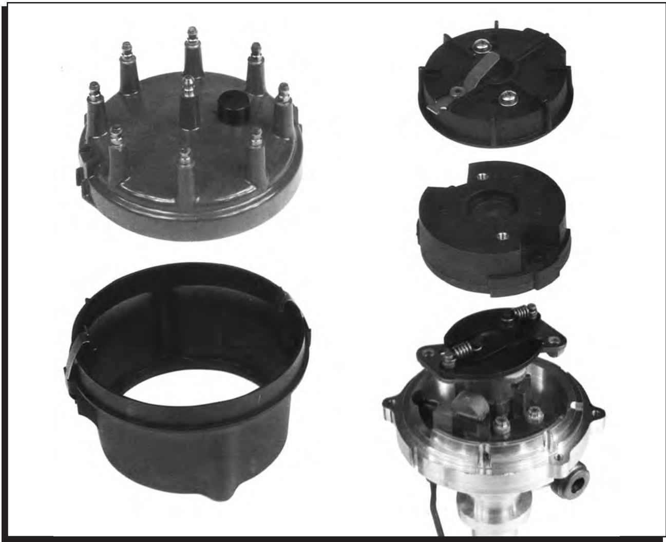
Figure 3 Installing the Cap-A-Dapt.

Note: If you are swapping from a socket style distributor cap to the Cap-A-Dapt you will need new spark plug terminals and boots. The correct boots and terminals are sold in a set as PN 8850.