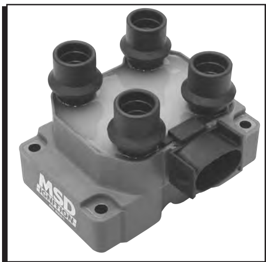
Figure 1 The MSD Ford 4- Tower Coil Pack.

WARNING: High Voltage is present on the coil terminals. DO NOT touch the coil terminals or tower when the engine is cranking or running.