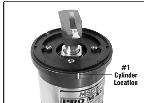
Figure 2 Positioning the Rotor Tip.