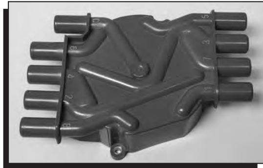
Figure 2 Distributor Cap.