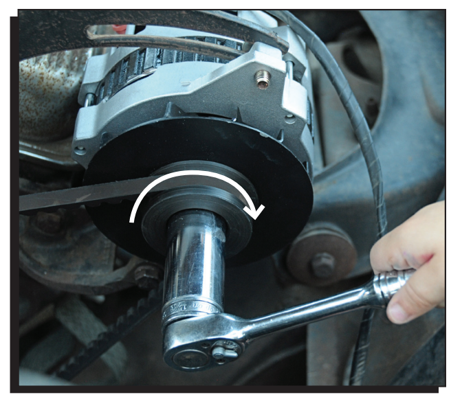
Figure 3 Checking Belt Tension.

CAUTION: Never disconnect the battery when the engine is running. Damage to the alternator will occur.