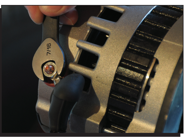
Figure 4 Installing the Charge Wire.