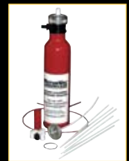
INTAKE CLEANING KIT (INCLUDED) Part No. 200-8667