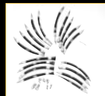
DELUXE KIT (INCLUDED) Part No. 200-3026