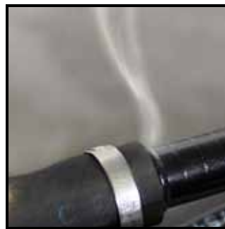
Smoke exposes the leak.

The cabinet design provides technician-friendly onboard storage of all adapters and accessories.