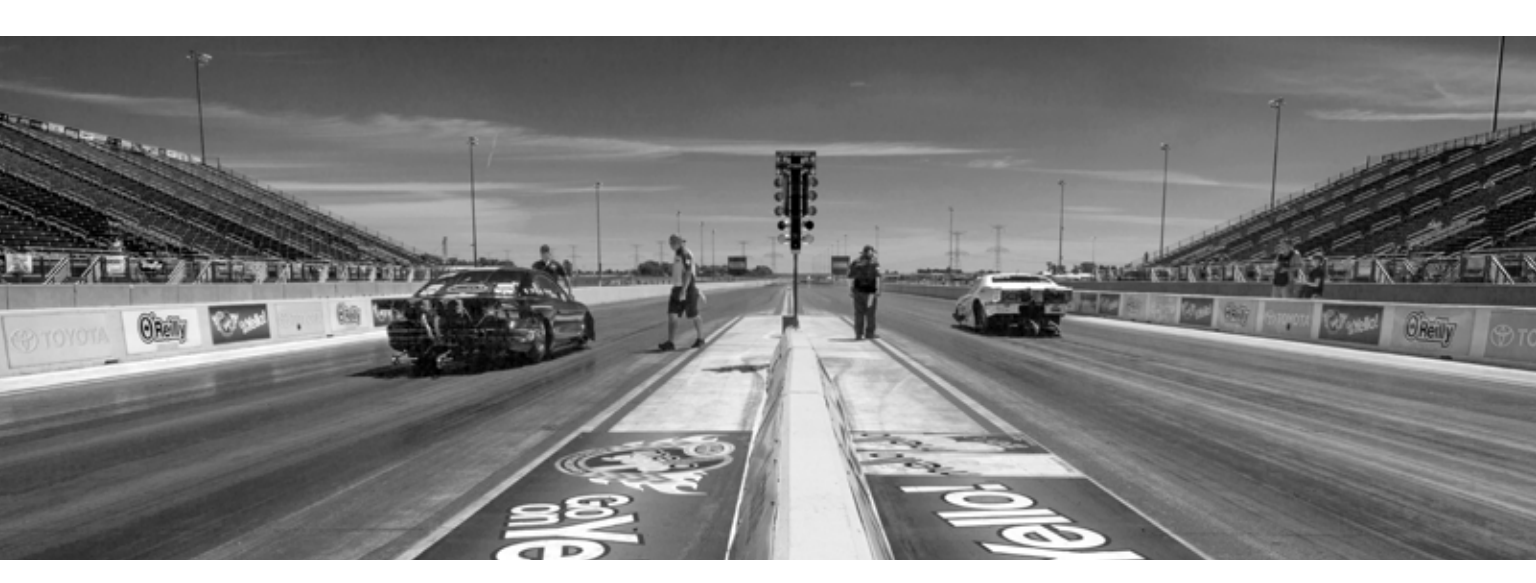
Add 'T' to part number for Timken<sup>®</sup> bearings

NOTE: We recommend the use of a Daytona pinion support and solid spacer in all racing applications.